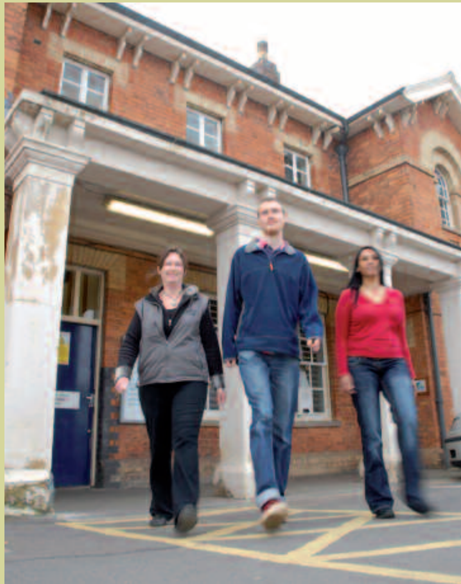
Oakham is bustling with new tenants

The key to the initiative is a new, standard, low-cost three-party lease between Network Rail, the tenant and the train operating company (TOC). A